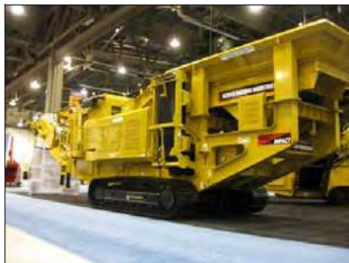
4043T Impact Crusher