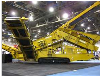
Spyder 516T Screening Plant