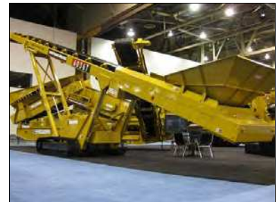
6036T Track Conveyor