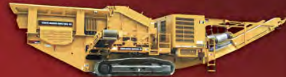
5256T IMPACT CRUSHER