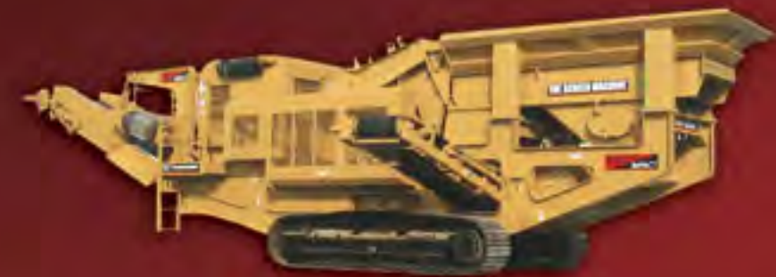
4043T IMPACT CRUSHER

A wireless remote control device operates the activity of the chamber lift feature from the comfort of the loader cab or upwards of 300' away.