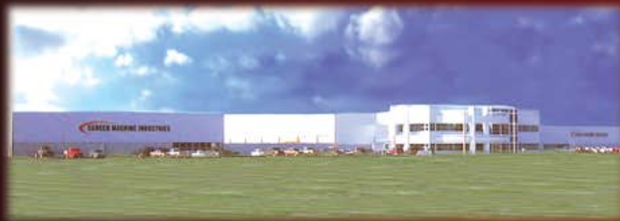
Screen Machine Industries, Inc. Corporate Headquarters

Screen Machine Industries, Inc. is an innovative American manufacturer of portable machinery dedicated to material crushing, screening, washing and stockpiling. Our product offering provides production solutions across a vast array of applications ranging from 15 – 600 tons/yards per hour (rock, sand & gravel, concrete & asphalt, topsoil & compost products, just to name a few). Our engineering design philosophy of incorporating only industry leading brand name components and feature rich competitive advantages has prominently influenced our 40+ years of success.