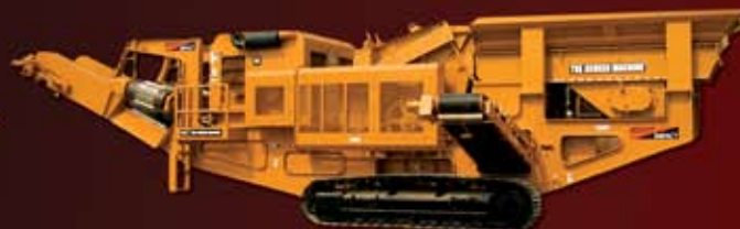
4043T IMPACT CRUSHER