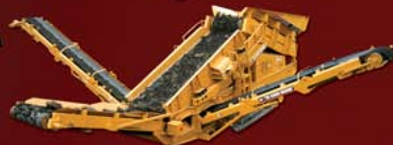
SPYDER 512T & 516T