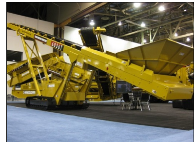
6036T Track Conveyor