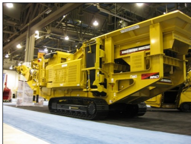
4043T Impact Crusher