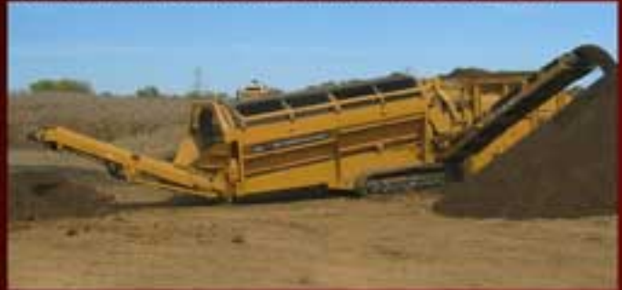
621T Matched to a 3-5 Yard Loader

Founded in 1967, SCREEN MACHINE INDUSTRIES, INC. is one of the largest manufacturers of portable screening, crushing and shredding plants in North America. THE SCREEN MACHINE® brand, featuring US sourced name brand parts is built in a new state-of-the-art manufacturing facility located near Columbus, Ohio.