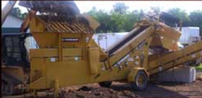
MIGHT II Matched to a 1/2 Yard Loader

The Achiever Shredder/Trommel is one in a family of four trommel machines in the Screen Machine product line. Our wide range of models, including the Might II , Pulverize III , Achiever 511 and the tracked 621T are perfect for contractors of any size. So whether you are a small landscaper with a skid steer or a large municipality with a 3 to 5 yard loader, Screen Machine Industries has you covered.